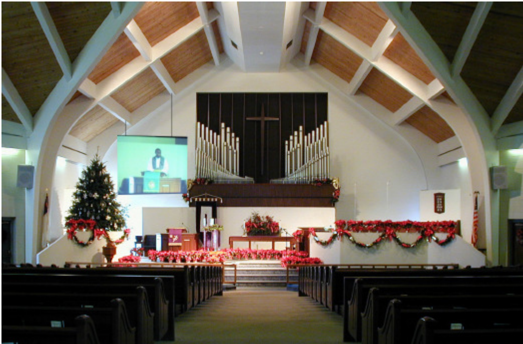
Powered screen depicted in fully open position above the sacristy entrance. Hanging rods would be painted white to match screen case. Screen retracts fully into white textured case. See picture below.